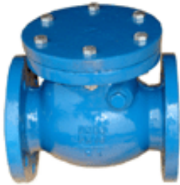
Figure:H4486 Size:DN40-DN400 Design Standard:DIN Face to Face:DIN3202-F6 Flange Drilling:DIN2532;DIN2533 ect