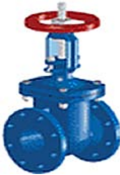
Figure: Z41032 Size : 2"-12" Design Standard : BS5163 Face to Face : BS5163 Flange Drilling : BS4504 PN16