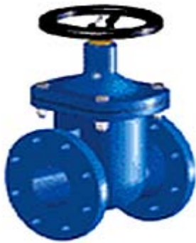
Figure: Z45032 Size : 2"-12" Design Standard : BS5123 Face to Face : BS5163 Flange Drilling : BS4504